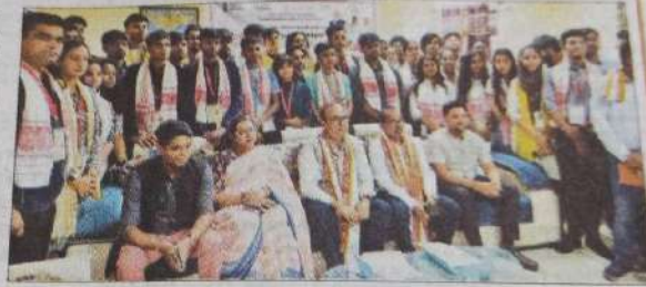
Officials of NIT Silchar and delegates from various Delhi universities pose for a photograph.