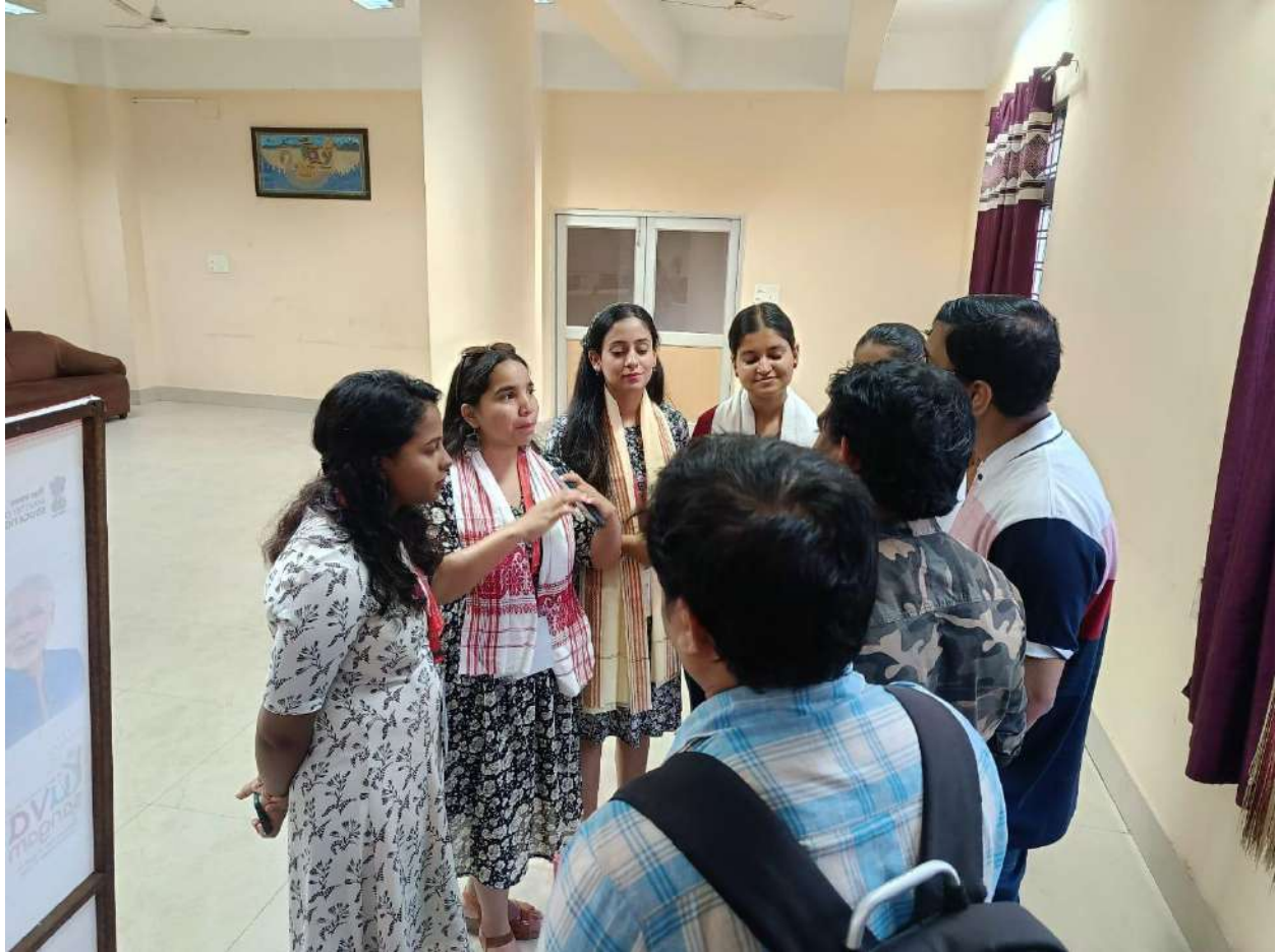
Answering Questions to Press during Press Conference